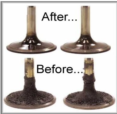
Intake valve with heavy deposit build-up. Intake valve after service.

Recommended service interval: 15,000 miles