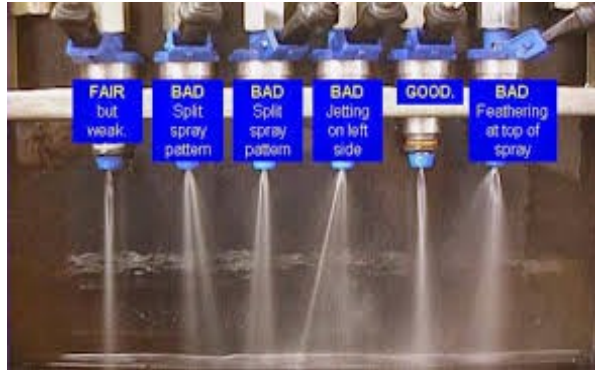
Fouled fuel injector produces irregular spray pattern, Clean fuel injector displays proper spray pattern.

Utilizing specialized tools, one of our skilled technicians will immediately: