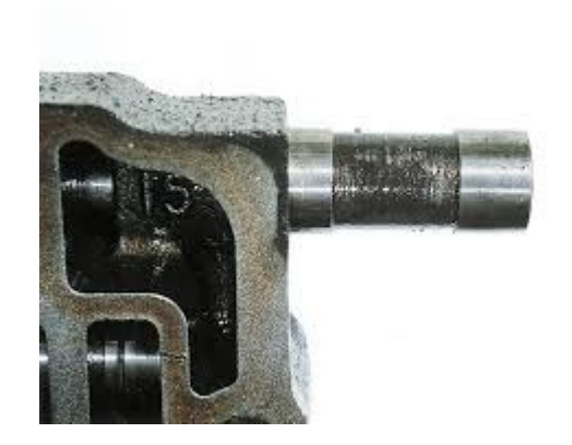
Valve body spool with heavy deposit build-up.